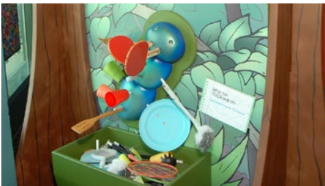
In the Jungle: Build-A-Bug Size: 3'x7', 9'4" height