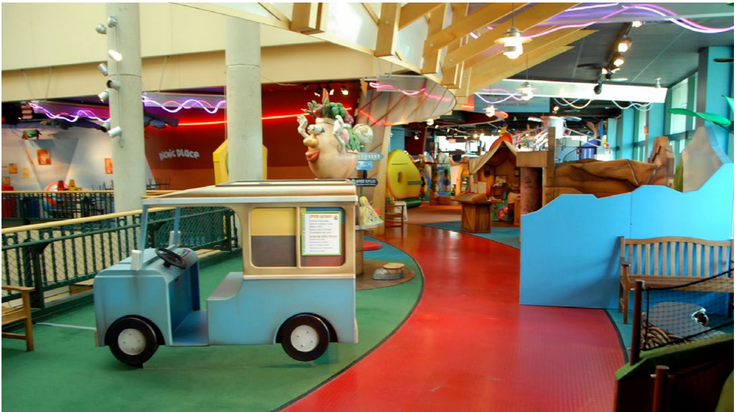
Exhibit Sale Information

Careers • Role-play • Problem-Solving • Literacy