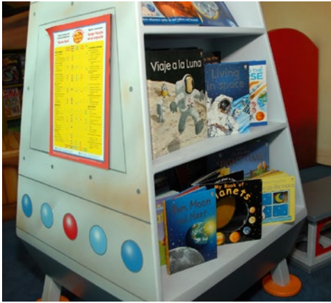
Satellite Pod Resource Area