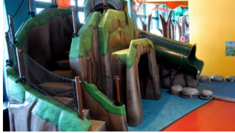
Cave: Sound Activities, Texture Cubbies, Flip Rocks Size: 16'x15', 9'4" height