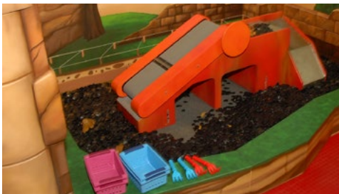
Dig Site: Mural, Conveyor, Wall