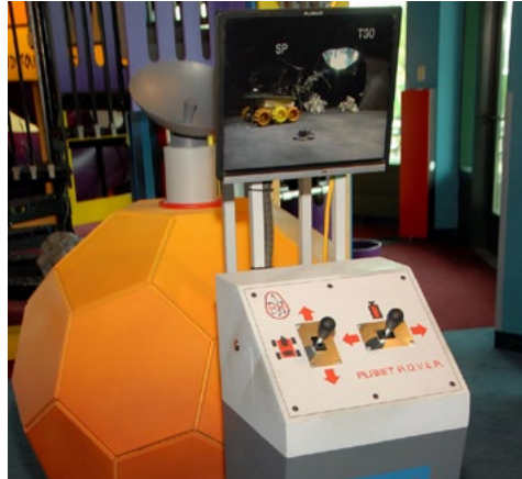
Rover Dome: Dome, Control Panel, Monitor