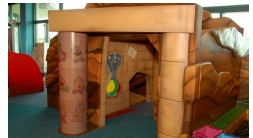
Treasure Chamber: Pillar, Crawl Through, Timer, Treasure Compartments, Wall