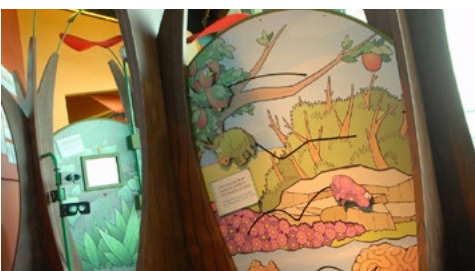
In the Jungle: Camouflage Activity Size: 3'x7', 9'4" height