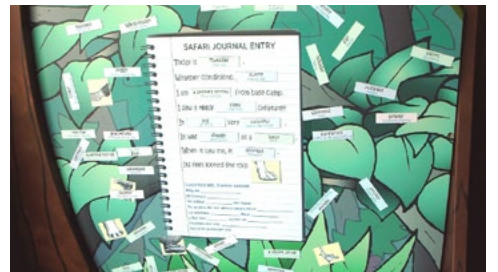
In the Jungle: Field Journal Size: 3'x7', 9'4" height