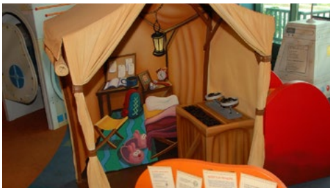
Treasure Chamber: Mural, Reassembly Table, Weighing Table, Map