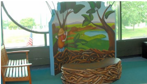
Bird's Nest Reading Area Size: 9'x8', 6' height