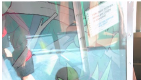
In the Jungle: Wind Chamber Size: 3'x7', 9'4" height