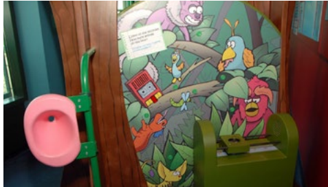
In the Jungle: Sound Activity Size: 3'x7', 9'4" height