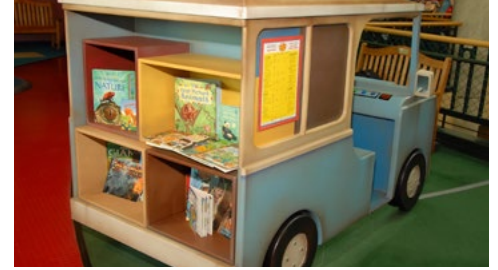
Jungle Rover: Supplies, Cab Activities Size: 8'x5', 5' height