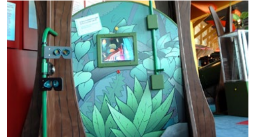
In the Jungle: Sight Activity Size: 3'x7', 9'4" height