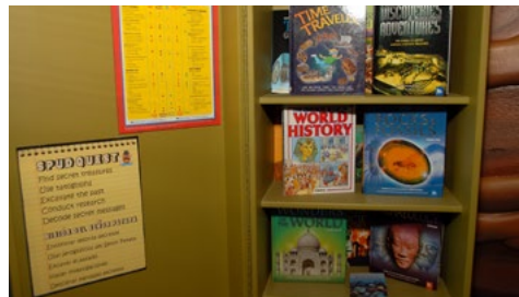
Steamer Trunk Resource Area: optional box seats