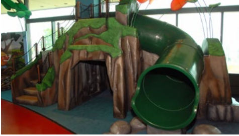
Mudslide: Slide Size: 16'x15', 9'4" height