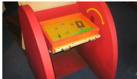
Dig Site (continued): Sifter